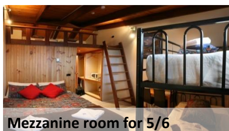
Mezzanine room for 5/6