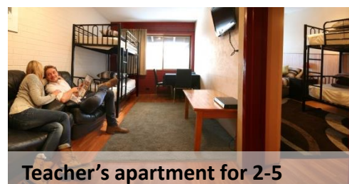
Teacher's apartment for 2-5